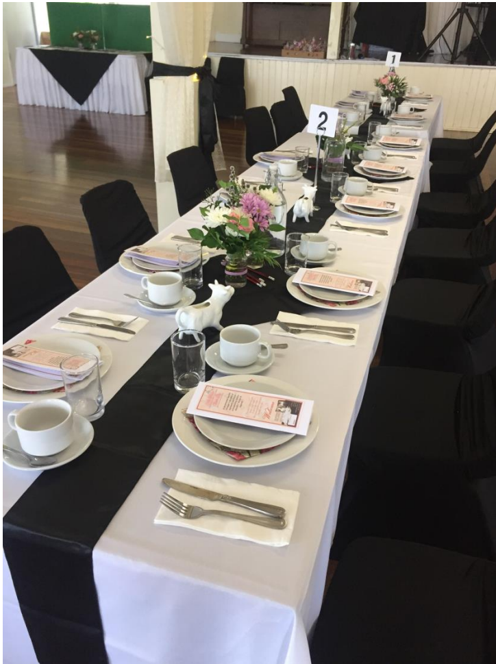
Table decorations and accessories from elegant to rustic Table mirrors Rustic Wooden table discs Wedding Arches Pew Bows Red Carpet Runner Bridal table skirting and styling Signing tables Cake tables Star Curtain Vertical lace drapes Mirror Ball Wagon Wheel Chandelier Wishing Well Treasure Chest Theming Co-ordination Cocktails MANY,MANY more

We also offer full co-ordination services, and can help with the most unlikely of things. We will work to your Budget and your concept. If we don't have it we almost always know where the best bargain is: